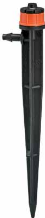
Shrubbler® 360° PC Spike 4 mm