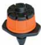
Shrubbler® 360° PC Barb 4 mm

Pots, planter boxes, balcony, patio and landscape applications.